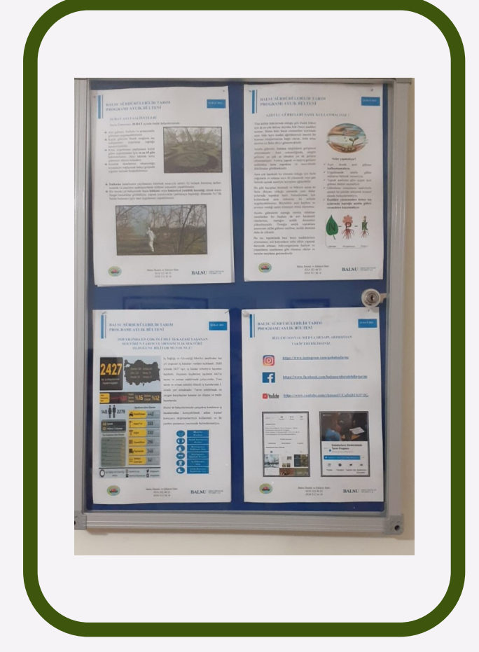
Balsu Sustainable Agriculture Program "Farmers' information Bulletin on Villages' coffeehouses"

You can access our digital trainings and information provided on hazelnut farming agenda throughout the year on our social media accounts.